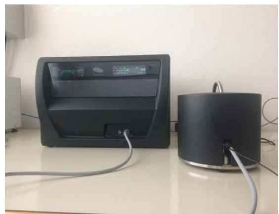
Fig. 3 Measurements in the Laboratory for measurements, Chair of Thermal Engineering, Faculty of Natural Sciences and Engineering, University of Ljubljana.

A few decades ago, yttria (Y<sub>2</sub>O<sub>3</sub>) stabilized zirconium oxide ceramics (3Y-TZP (3mol.% yttrium tetragonal zirconia polycrystals)), with significantly improved mechanical properties compared to silicate ceramics and glass ceramics was introduced into dental medicine. 3Y-TZP is available in dentistry for the fabrication of dental crowns and fixed partial dentures. Its flexural strength reaches 900 – 1200 MPa and fracture strength about 9 – 10 MPa(m)<sup>1/2</sup>.