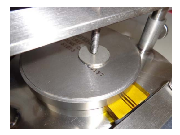
Fig. 4 Testing disk from TiAl6V4 alloy.

TiAl6V4 (Grade 5: 6% Al, 4% V, 0.25% > Fe and 0.2% > O (bal. Titanium)) is the most commonly used titanium alloy in dentistry. It is significantly stronger ( R_m > 895 MPa, R_{p0,2} > 828 MPa) than commercially pure titanium while having the same stiffness. This grade is an excellent combination of strength, corrosion resistance, weldability and machinability, and has good osseointegration properties.