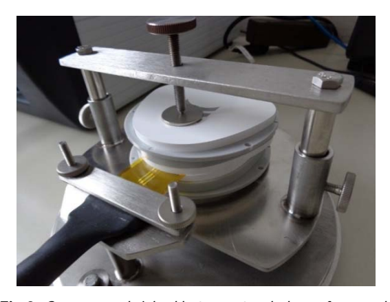
Fig 2 Sensor sandwiched between two halves of a sample during measurement.

During measurement of solids, encapsulated Ni-sensor is sandwiched between two halves of the sample (Figure 2) and constant precise pre-set heating power is released by the sensor, followed by 200 resistance recording in a preset measuring time, from which the relation between time and temperature change is established. Based on time dependent temperature increase of the sensor, thermal properties of the tested material are calculated.