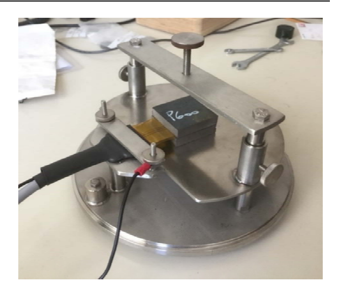
Fig. 3 Measuring sensor sandwiched between two halves of a sample during measurement

The instrument can be used for determining thermal properties of various materials including pure metals, alloys, minerals, ceramics, plastics, glasses, powders and viscous liquids with thermal conductivity in the range from 0.01 to 500 W/mK, thermal diffusivity from 0.01 to 300 mm2/s and heat capacity up to 5 MJ/m3K. Measurements can be perform in a temperature interval between -50 °C up to 750 °C.