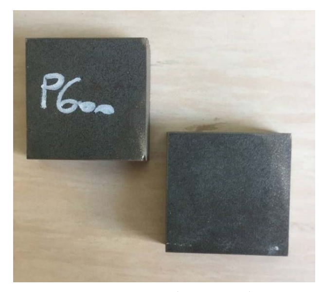
Fig.5 Testing samples (40 x 40 x 14 mm).

In Fig.6 are presented results of thermal properties measurements.