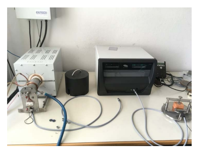
Fig. 2 Instrument Hot Disk TPS 2200

In our research, we used one of the most advanced instruments for determining the thermal properties, Hot Disk TPS 2200, a product of Hot Disk AB company, Gothenburg, Sweden (Figure 2) [6].